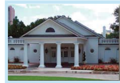
Arlington Hall at Lee Park

http://www.arlingtonhallatleepark.com/index.htm (map and directions on back)